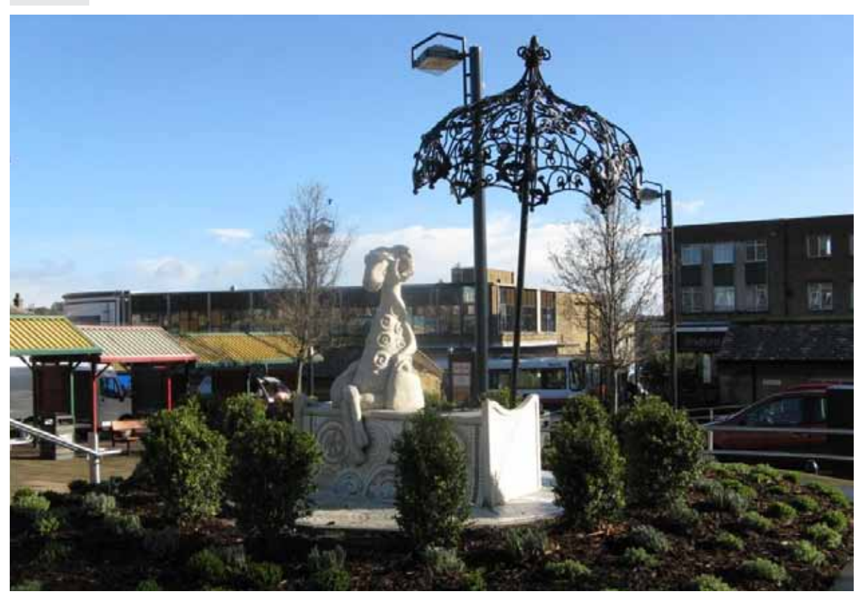
Shipley Town Centre